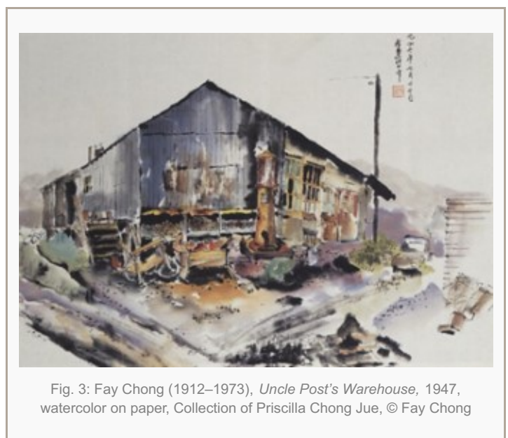
Fig. 3: Fay Chong (1912–1973), Uncle Post’s Warehouse , 1947, watercolor on paper, Collection of Priscilla Chong Jue, © Fay Chong

23 Andrew Chinn’s work truly shines, though, in purer landscapes, studied either in one of Washington’s lush national forests or one of Seattle’s many urban retreats. “Nature nourished him in every way: emotionally, mentally, physically and spiritually” (Beers). In Seward Park ( an area in southeast Seattle ), Chinn delineates tree shadows and the edges of the hilly terrain with needle-thin lines of Chinese ink, but delicately feathers the brushwork when suggesting birch tree leaves softly waving under a typically overcast Northwestern sky (Fig. 4).