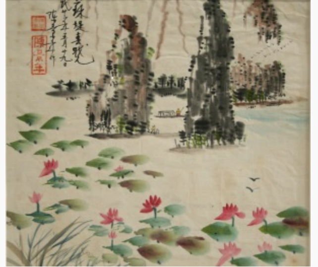
8.5 in., Fine Impressions Gallery, Seattle WA, ©Andrew Chinn